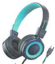
Headphones w/ USB-C