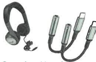
Regular Headphones + Adapter